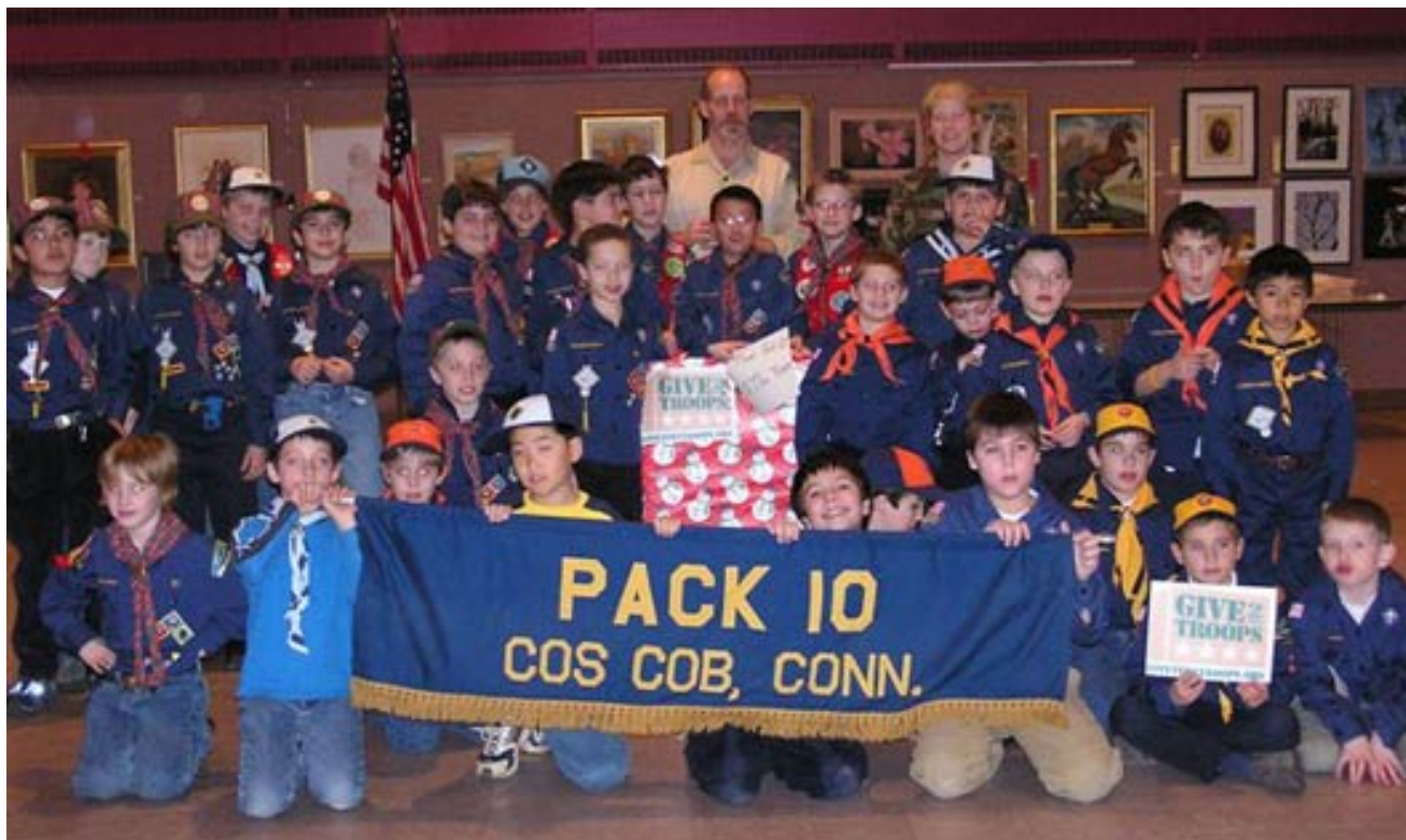
Pictured above is Cub Scout Pack 10 of Cos Cob, Connecticut .